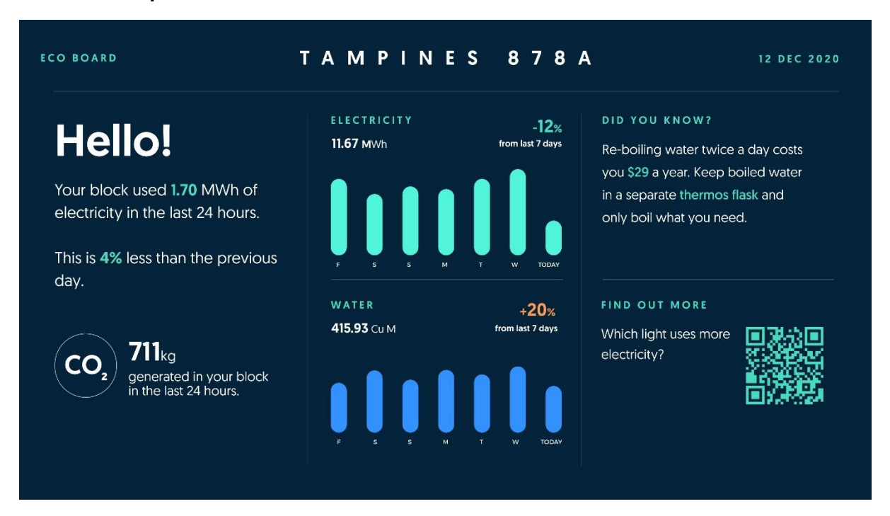
Annex A: Sample of Eco Board