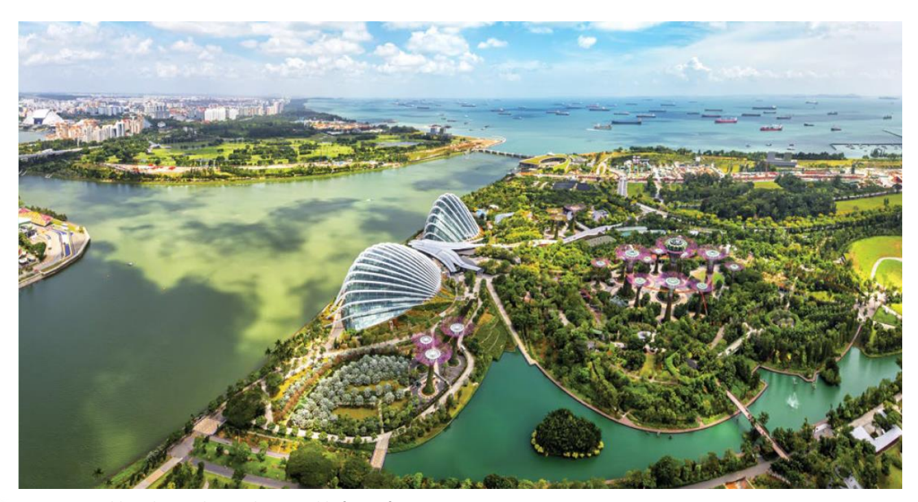
SP Group enables a low-carbon and sustainable future for Singapore.