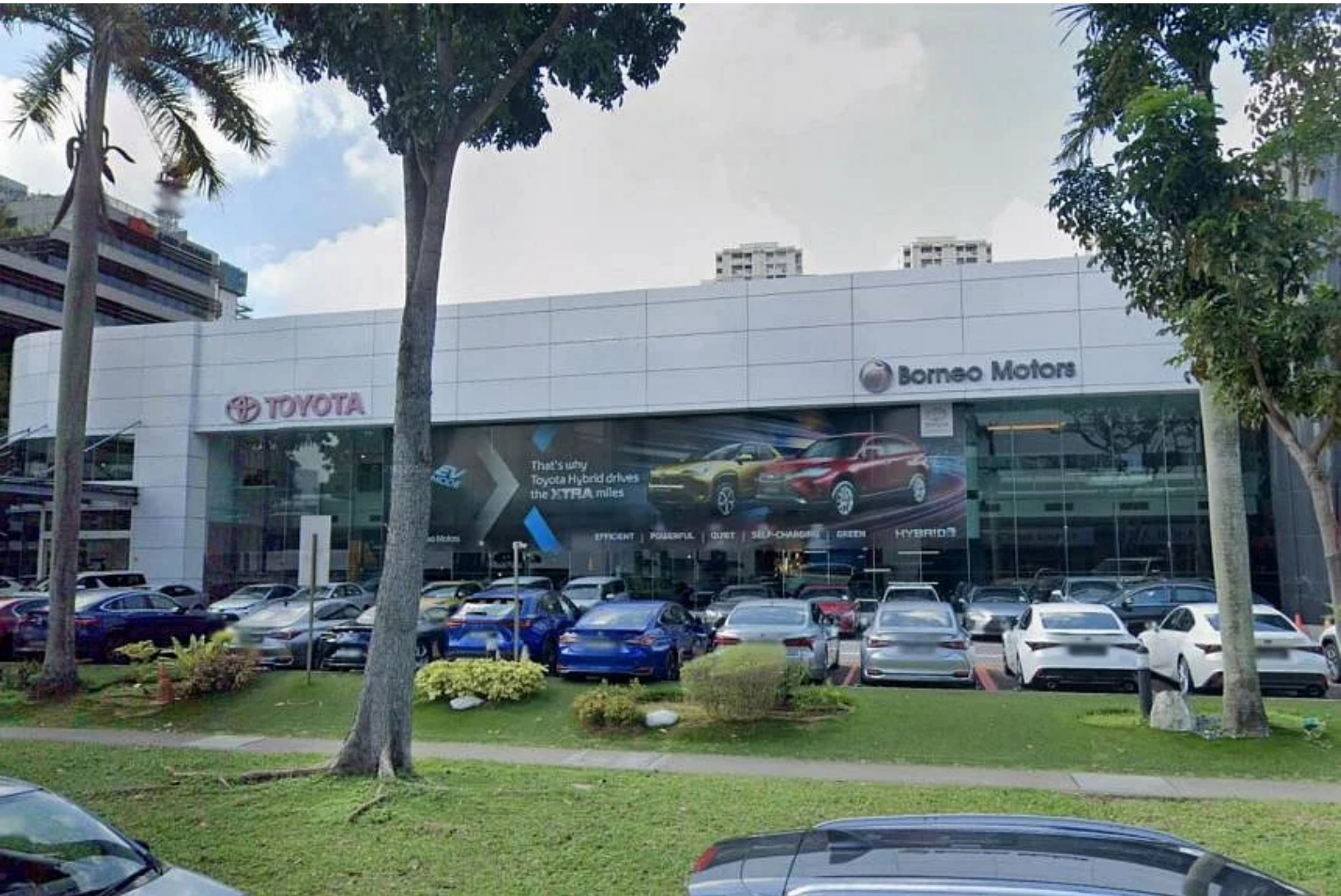
Various electrified Toyota models will be made available to Tengah residents through a car-sharing pilot between Borneo Motors and SP Group.